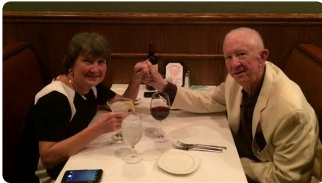
Our 49th Anniversary