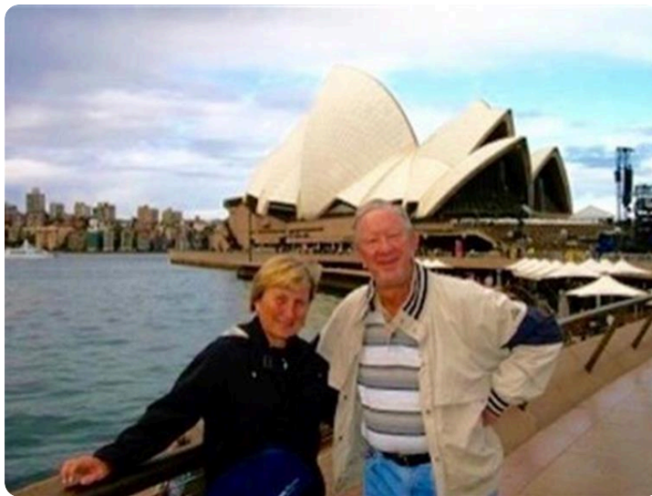
Visit to Opera House