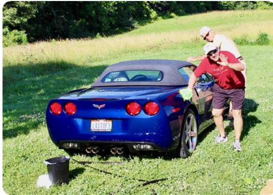
During a road trip to St. Louis keeping our Vettes clean